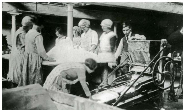
The Lotor Soap Factory c.1920

In the first decades of the 19 th century the tennis court was also used for political meetings, boxing matches and (for a few months) an 'Equestrian Circus'! Later in the 19 th century it became a brewery, in the 20 th century a soap factory and a warehouse – and now the perfect home for the Museum of Bath at Work.